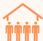
Community and Environment